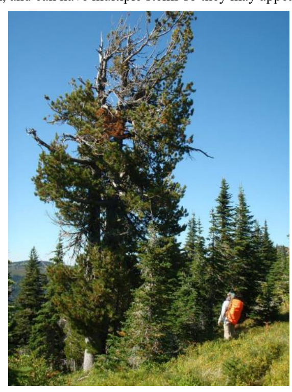
(Continued on page 3)

It is a tree of high elevations, one of the five needle pines, long-lived (500-1000 years), found in eight states including Idaho. It is a stone pine, with large, dense seeds in cones that don't open at maturity. The seeds are dispersed by Clark's Nutcrackers. These amazing birds bury the seeds in caches, one inch or so underground. One bird can store more than 35,000 seeds per year and remember where most of them are! The unretrieved can germinate. Whitebark pines have an irregular growth form, and can have multiple stems so they may appear