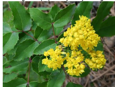
Oregon Grape

Thanks go to the Master Gardeners for their gracious cooperation in the first year of this program. In the fall, applications will be available for the 2010 scholarship.