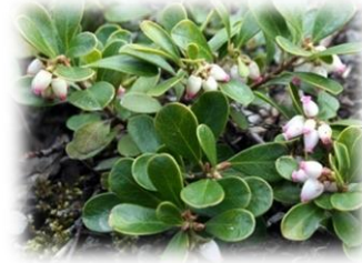
Kinnikinnick