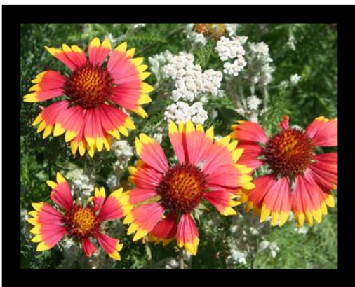
Indian Blanket Flower