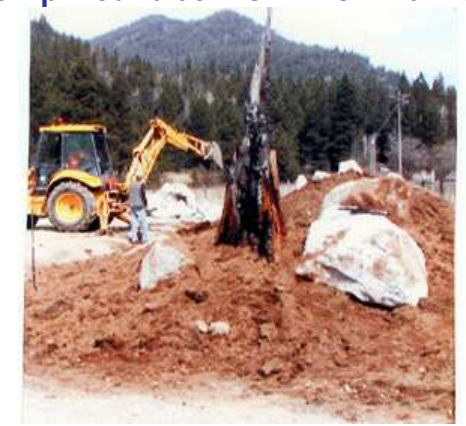
Before (above) and After (below)